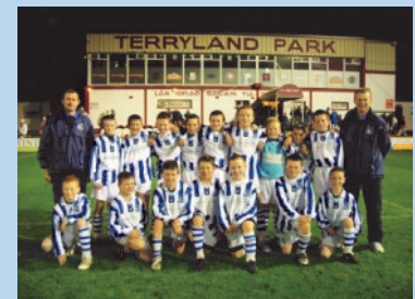
Victorious U-11's in Terryland

and recorded a memorable 6-0 win over Hibs/Foyle in their Menton cup game. This was an occasion that will live long in the memories of the players