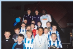
Galway Utd. players pose with the U-8 squad