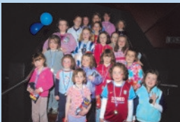
U-8 Girls pose with their end of season medals and "Treats"