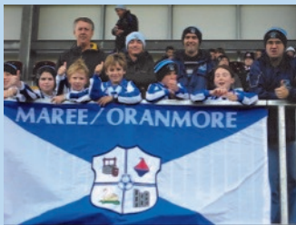
Thumbs up from Terryland!

On Sunday October 26 th , 42 Maree/Oranmore AFC players from the U-9 and U-10 age-groups (boys & girls) alongside 9 club