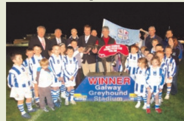
We're all winners!

Answer #1 : Yes. Not only that, but if playing by FIFA rules they are also free to send in a substitute to take the kick if they have any substitutes left. Answer #2 : Yes, it would be a goal. The referee is part of the field. If he/she gets in the way of the ball, too bad. Answer #3 : Drop the ball where the ball bursts. If it bursts in the goal area, then the ball is dropped at the top of the goal area closest to the bursting spot. Answer #4 : No, removing the corner flag is not allowed, and to do so may result in a caution for unsporting behaviour. A player may return a leaning flag to its upright position, but they may not bend it out of the way or remove it. If there is an issue with the flag, it is up to the referee to decide what to do, not the player.