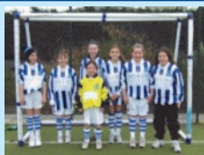
Girls at the Nov Blitz