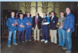
Coach and Committee awards—the unsung heroes!!